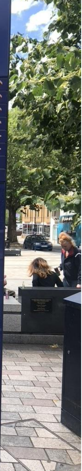
High St, no mention of toilets