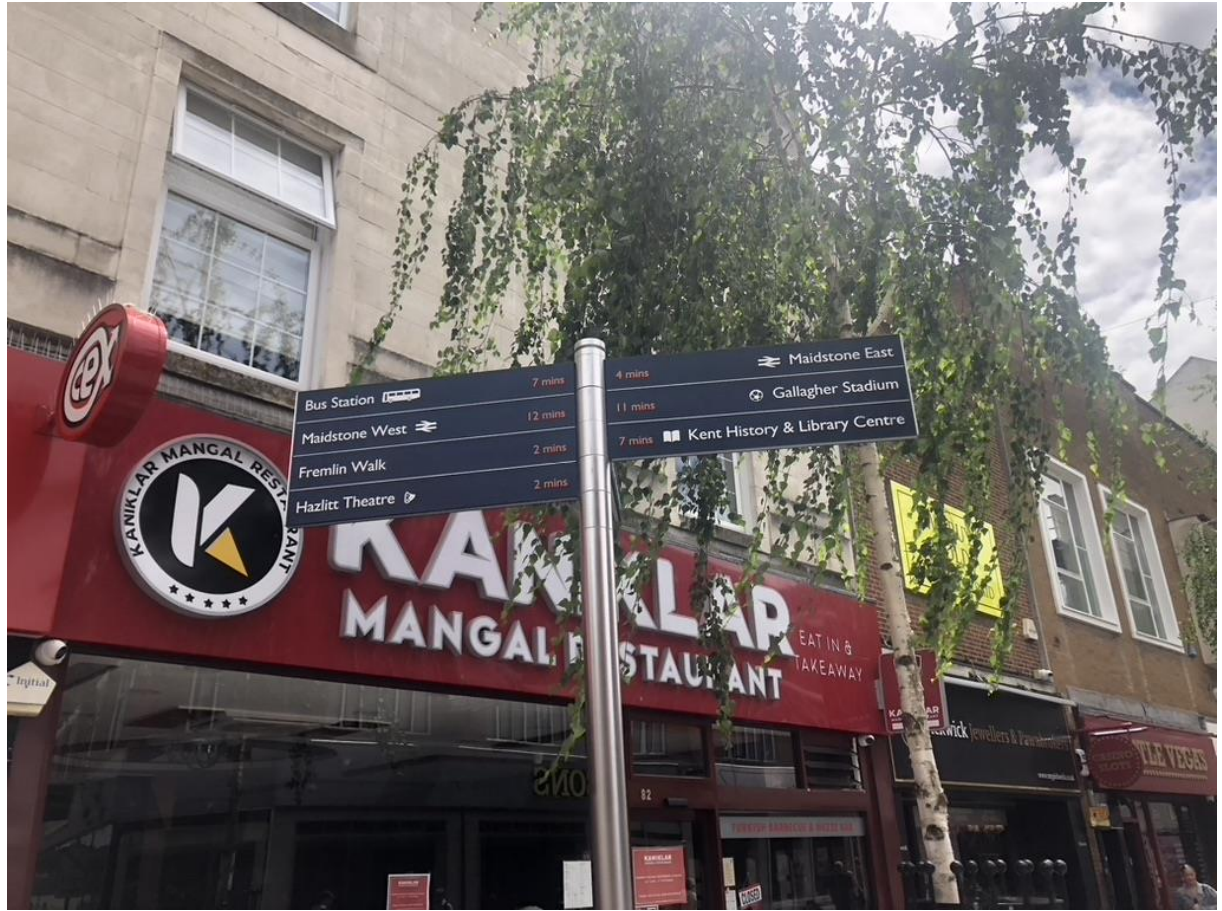
Week St, key signpost with no mention of toilets.