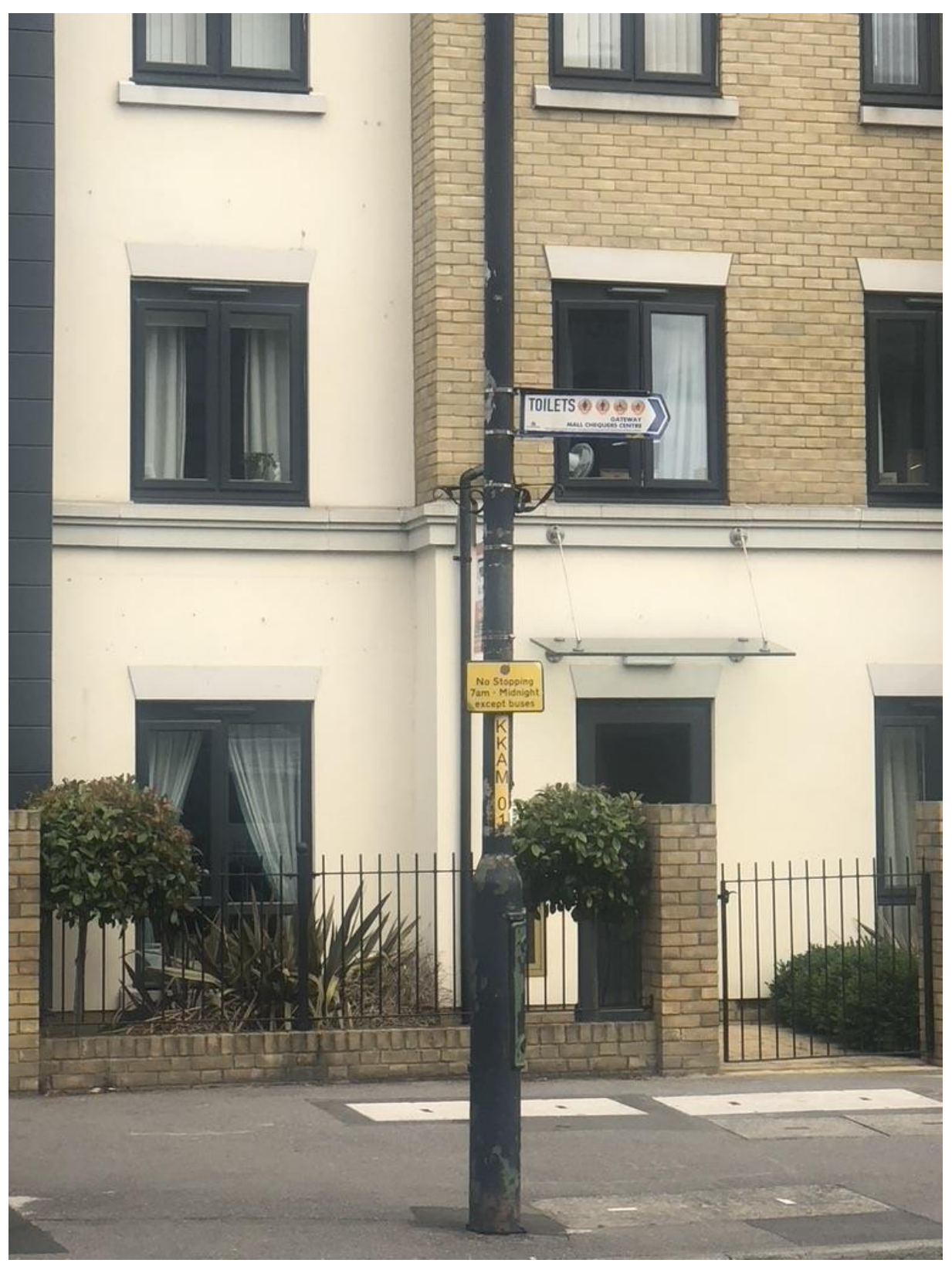
King St, away from main shopping area.