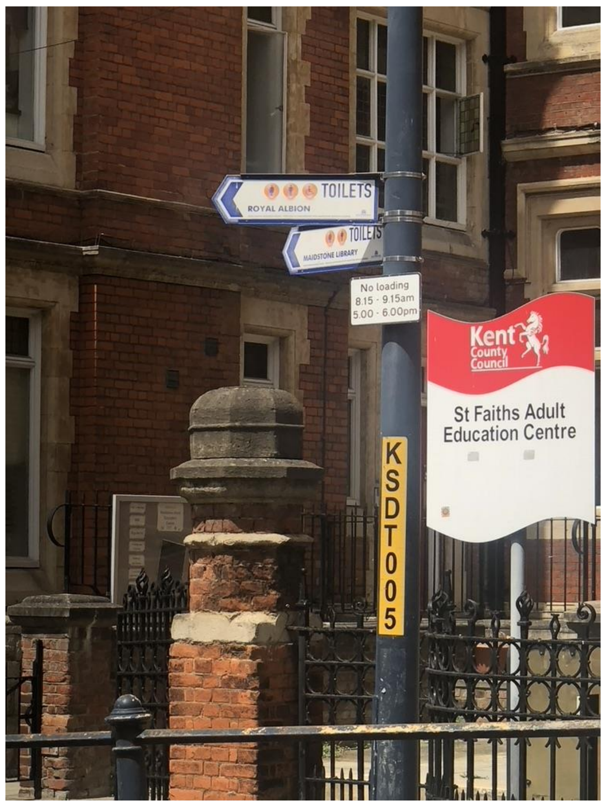
St Faiths St, away from key town shopping area. Maidstone Library closed in 2012.